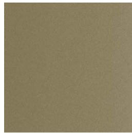
110 FT bronze fine textured