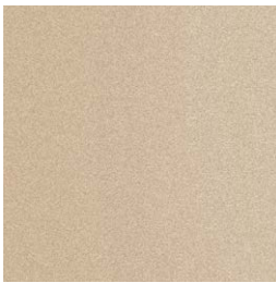
109 FT champagne fine textured