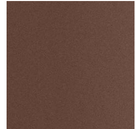
108 FT oxide fine textured