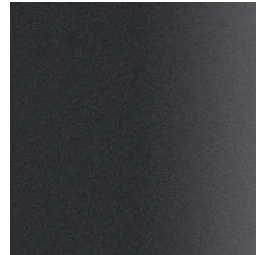
111 FT graphite fine textured