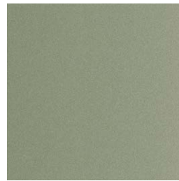
113 FT sage fine textured