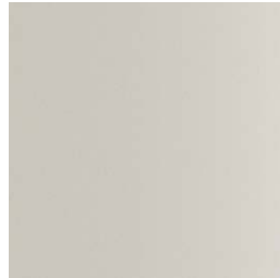
102 FT light grey fine textured