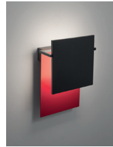
C1 wall rotating scene