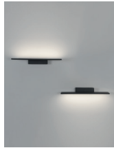
C1 / R1 wall rotating R1 wall