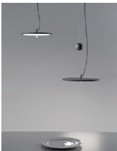
D1 / D2 ceiling D1 / D2 ceiling up&down