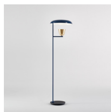
LIGHTOLIGHT P Floor lamp