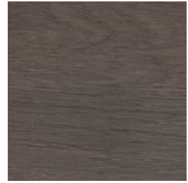
W05 dark stained