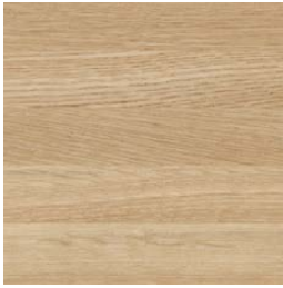
W01 natural oak