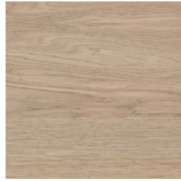
W03 light oak