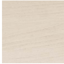
W02 white stained