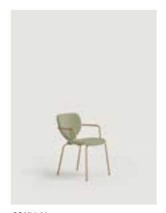
2311U-N Upholstered armchair with steel frame / Silla tanizada con brazos con estructura de acero