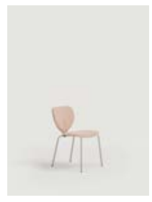
Upholstered chair with steel frame / Silla tapizada con estructura de acero