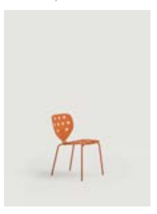
2311INOX Outdoor chair with aluminium seat and back. Inoxidable steel frame / Silla de exterior con asiento y respaldo de aluminio. Estructura de acero inoxidable