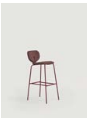
2319 Stool with oak wood seat and back. Steel frame / Taburete con asiento y respaldo de roble. Estructura de acero.