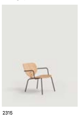
Lounge chair with oak wood seat and back. Steel frame / Butaca con asiento y respaldo de roble. Estructura de acero.