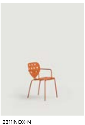
Outdoor armchair with aluminium seat and back. Inoxidable steel frame / Silla de exterior con brazos con asiento y respaldo de aluminio. Estructura de acero inoxidable