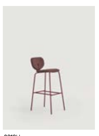
2319U Upholstered stool with steel frame / Taburete tapizado con estructura de acero.