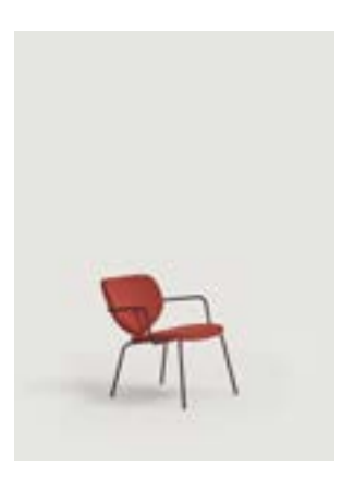
2315 U Upholstered lounge chair with steel frame / Butaca tapizada con estructura de acero.