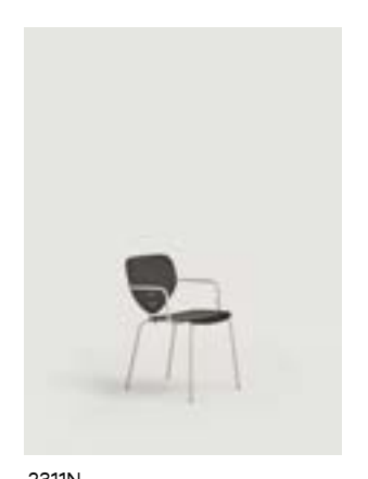
Armchair with oak wood seat and back. Steel frame / Silla con brazos con asiento y respaldo de roble. Estructura de acero.