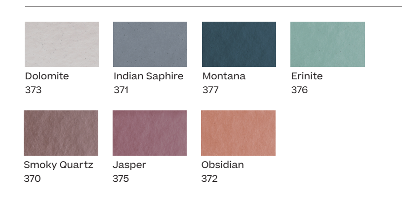
Table Top Colour Options