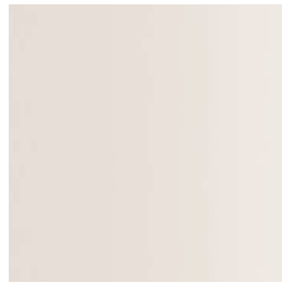
124 FT linen fine textured