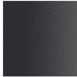
111 FT graphite fine textured