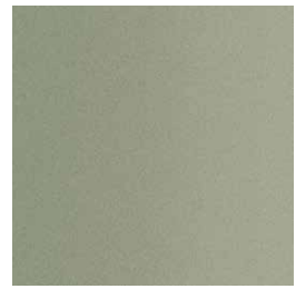
113 FT sage fine textured