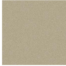
327 titanium bronze - satin