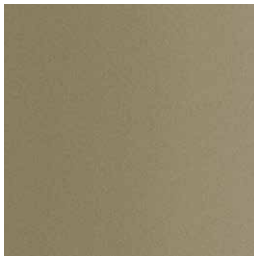
110 FT bronze fine textured