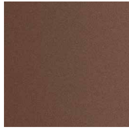
108 FT oxide fine textured