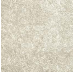
320 silver quartzite - matt