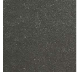
321 italian slate - matt