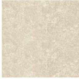
323 natural chalkstone - matt