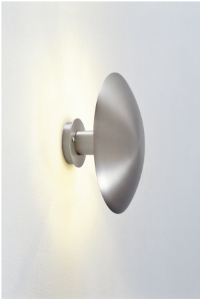
( B ) Disco medium