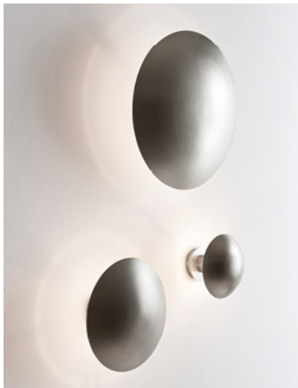
( A ) Disco small, ( B ) Disco medium, ( C ) Disco large

A steel disc hides the light source and diffuses it around the opaque circle. The light is reflected on the wall and creates a halo around the disc, rather like the luminescence of stars during an eclipse.