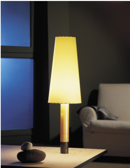
(D) Básica M2

The publication of the Básica lamp in 1987 was a return to warmth from the prevailing fashion of lamps with tubular metal structures (usually painted black) and dichroic halogen bulbs. This piece laid the foundations for the publisher's premises, became Santa & Cole's most emblematic piece and set a new trend in European design.