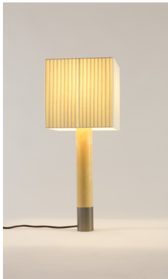
(B) Básica P3