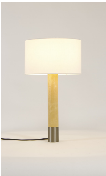
(A) Básica P2