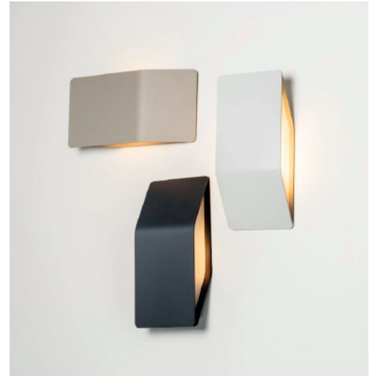
Pictures above might not show the specified dimensions or material. They are for illustration purposes only.