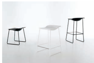
LAST MINUTE stool