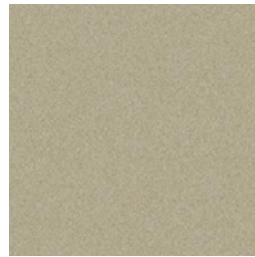
327 titanium bronze - satin