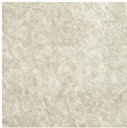
320 silver quartzite - matt