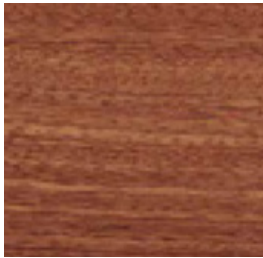
WS oiled sapele wood