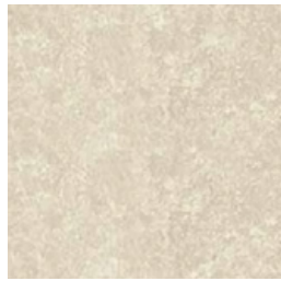
323 natural chalkstone - matt