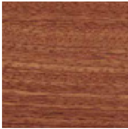
WS oiled sapele wood