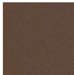
108 FT oxide fine textured