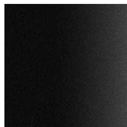
101 FT Black fine textured