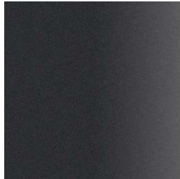
111 FT graphite fine textured