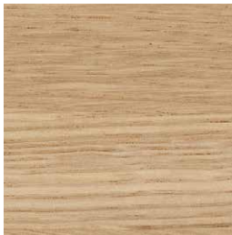
W01 natural oak