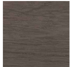
W04 black stained