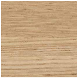
W01 natural oak