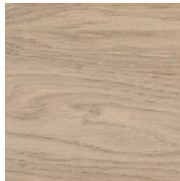
W03 light oak