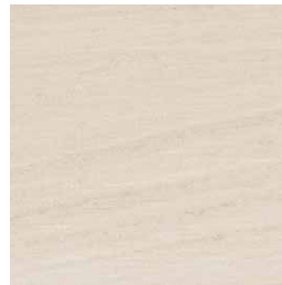
W02 white stained