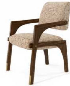
ARCHES Dining chair