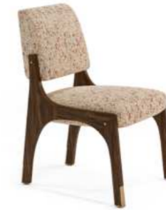
ARCHES II Dining chair