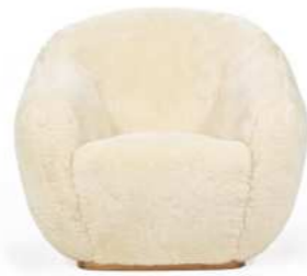
NIEMEYER II FUR Armchair