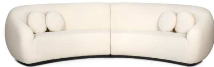
NIEMEYER II Round sofa