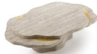
ARIZONA Coffee table