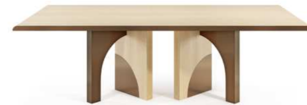
UTOPIA Dining table