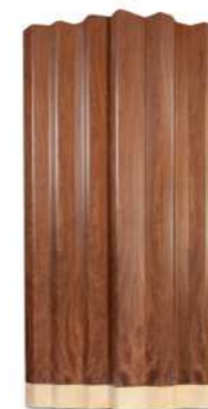
NAVAJO CANYON Cabinet