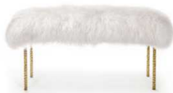
TREE BRANCHES Long bench