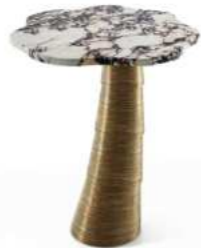
PALM Side table