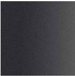
111 FT graphite fine textured