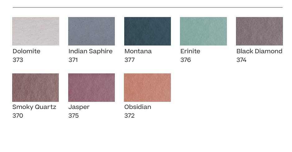
Table Top Colour Options