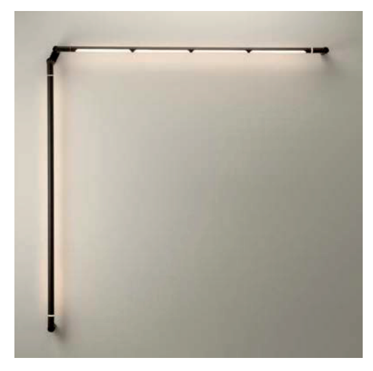
Pictures above might not show the specified dimensions or material. They are for illustration purposes only.