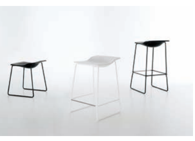
LAST MINUTE stool