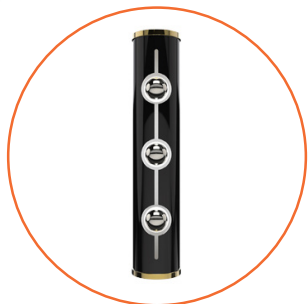
ALSO AVAILABLE CHUCK 3